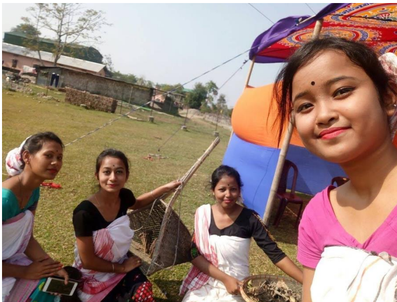
First Prize Winner at Cultural Rally in College Week 2017.